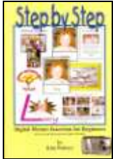
System Requirements: Microsoft Word 2000/XP/2003

This book and CD resource is a time saver for creating A4 sized pages to be used in portfolios, newsletters, posters and other documentation. The book showcases all of the 101 page designs found on the CD and details how and where to insert text and pictures into each. Create attractive designs in minutes then change the text or picture/s to individualize the documentation for each child. AutoShapes and a multitude of various table formats are used to create attractive and versatile layouts. Works on Mac computers also.