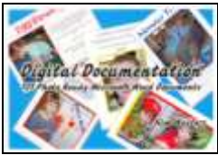
System Requirements: Microsoft Word 2000 - 2007

Digital Documentation 101 Photo Ready Microsoft Word Documents Book & CD 2 nd edition $60 Recently updated with additional instructions for use with Microsoft Word 2007.