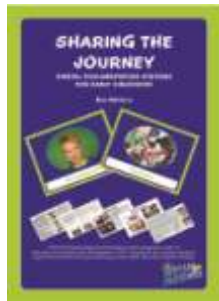
System Requirements: PowerPoint and Word XP - 2007, 1GB RAM, 5 GB storage

This training resource uses pictorial instructions, designed with the beginner in mind, to teach everything you need to know about using digital pictures in Word documents to create pictorial games, posters and portfolio pages. Learn to create and insert pictures into AutoShapes, WordArt, columns, tables and documents, add borders and overlap, rotate pictures and add special effects. The CD contains a collection of ready to go games, resources and page layouts along with a picture collection so you can start practising today. Games include Match A Face, Dominos and Sort A Face. Resources include Name charts and Alphabet A-Z. The CD also includes a variety of saved page layouts - including pages with columns, fixed and expanding tables.