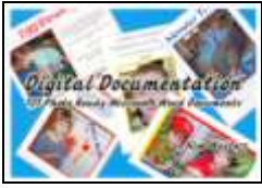
System Requirements: Microsoft Word 2000 - 2007

Digital Documentation 101 Photo Ready Microsoft Word Documents Book & CD 2 nd edition $60 Recently updated with additional instructions for use with Microsoft Word 2007.