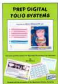
System Requirements: PowerPoint and Word XP - 2007, 1GB RAM, 5 GB storage

This resource aims to assist teachers working in Qld Preparatory Classrooms to monitor and assess children's learning. There are 5 READY TO GO systems on the CD each of which caters for 30 children. Each child has their own Folder for storage of digital artefacts and the child's folio and an Individual Observation Word document for observations and individual planning. Prep teachers should use either the Prep Folio Only Folder which contains a single Prep Folio or the Prep Folios System which links an Individual Observations Word document to each child's Folio and the Home Page. Copy text from the included Phase Descriptors Word document and paste into commentary sections of the folio then personalize. A journal Word document is included for teacher reflections and group planning. Primary and secondary classrooms should use the Child Power System for recording individual and group learning stories. Multi-age classrooms should use the Combined System which brings the Prep Folio and Child Power Systems together. The Learning Stories Only System is designed to showcase group learning stories in any classroom. NON EQ Schools are catered for with alternative Prep Systems based on the Diocese of Townsville Religious Understandings ELA. The easy to read guide walks teachers through the process of Choosing a System, Customizing a System, Setting Up a System and Using a System. The extensive Technical Help chapter aims to answer all your PowerPoint queries.